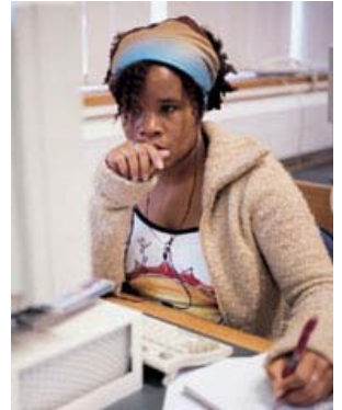
Global Network on IPR Research